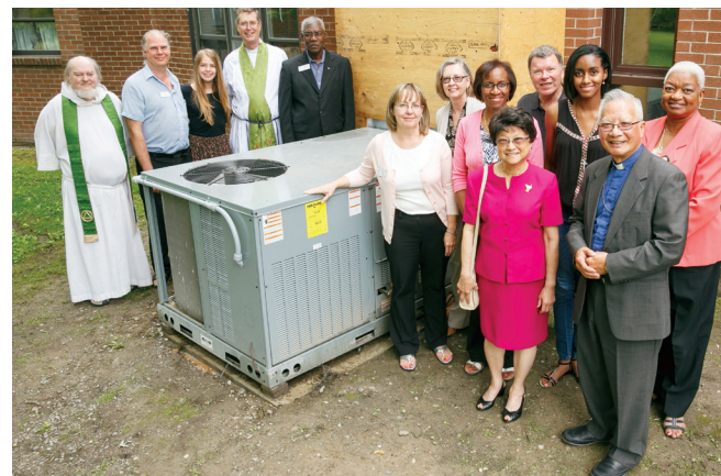
Grace Church, Markham used its parish rebates to replace the Church roof and install central air conditioning.