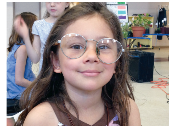
Christ Church, Stouffville, received a grant to hire a director of young Christian formation.*

Oshawa Area Parishes - $52,000 to provide joint church ministry for youth in the Oshawa area. This project involving Christ Memorial, St. George Memorial, St. Peter's, St. Matthew's, and Faith Lutheran churches in Oshawa will allow teens from all five churches to join together in an ecumenical group to support the spiritual, social, and community-service needs of youth in these churches as well as among youth who are not part of any church.