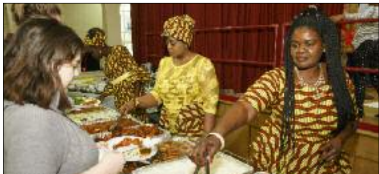
Enjoying African and Canadian food after the service.