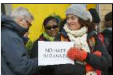
A woman holds a sign outside a mosque in Toronto.