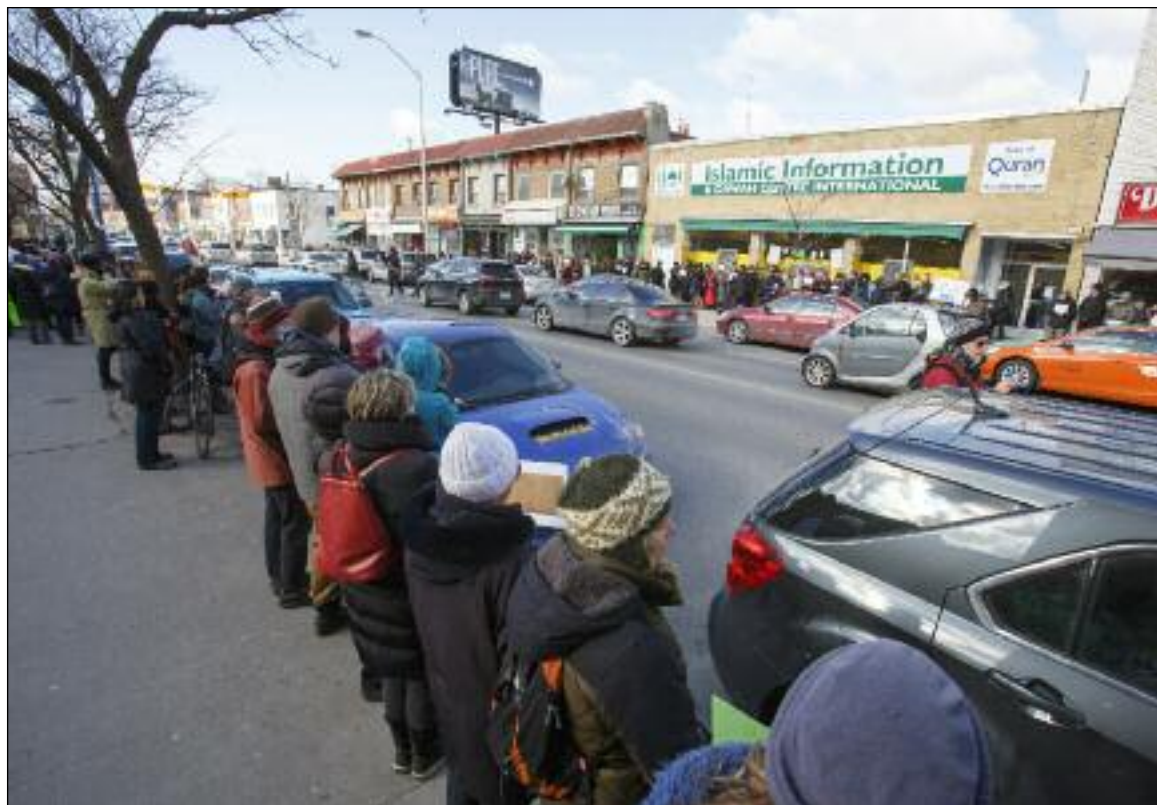
Supporters form a 'ring of peace' on both sides of Bloor Street outside the Islamic Information and Dawah Centre in Toronto's west end.

Like St. Anne's, churches throughout the diocese responded to the attack in Quebec city with love and support for the