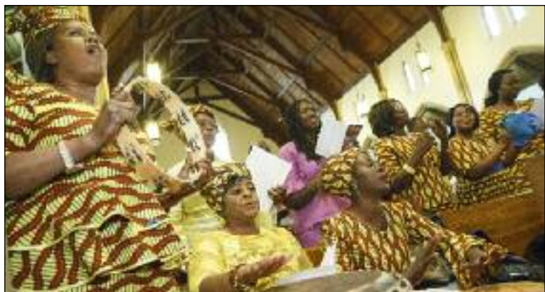
The Sudanese Community Church of Toronto's choir sings a hymn, accompanied by drums and tambourines.