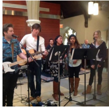
Heaven on Earth