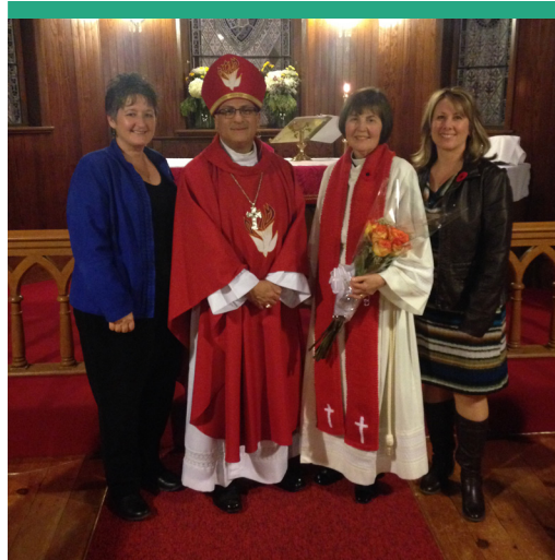
New ministry at Christ Church-St. Jude Ivy

Build a strong relationship between priest and people