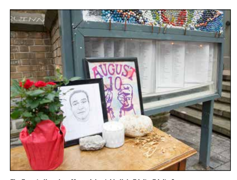
The Toronto Homeless Memorial outside Holy Trinity, Trinity Square.