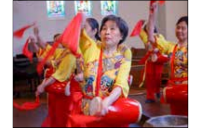
Drumming by members of the Paradise Seniors Association in Markham.