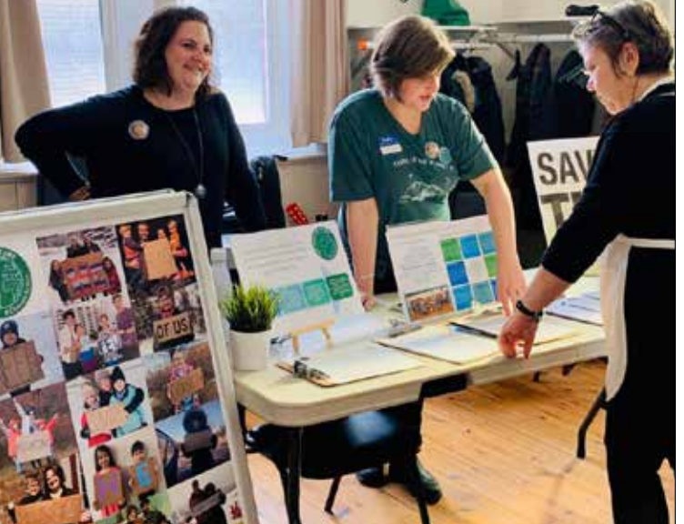
People help repair items in St. John's parish hall (left) while members of a local environmental group promote their activities.

restore as many items as possible for their owners. Even though it seemed the community had been intrigued by the concept of Repair Café before the event, those involved were thrilled by the steady stream of people who arrived bearing broken treasures in search of a second chance. Transferring skills from one generation to another occurred naturally as people sat and talked over the repair of their sweaters, chairs, lamps, toasters, guitars, bicycles and suitcases. Among the skilled repairers were a knife sharpener, an upholsterer, computer specialists, bike mechan-