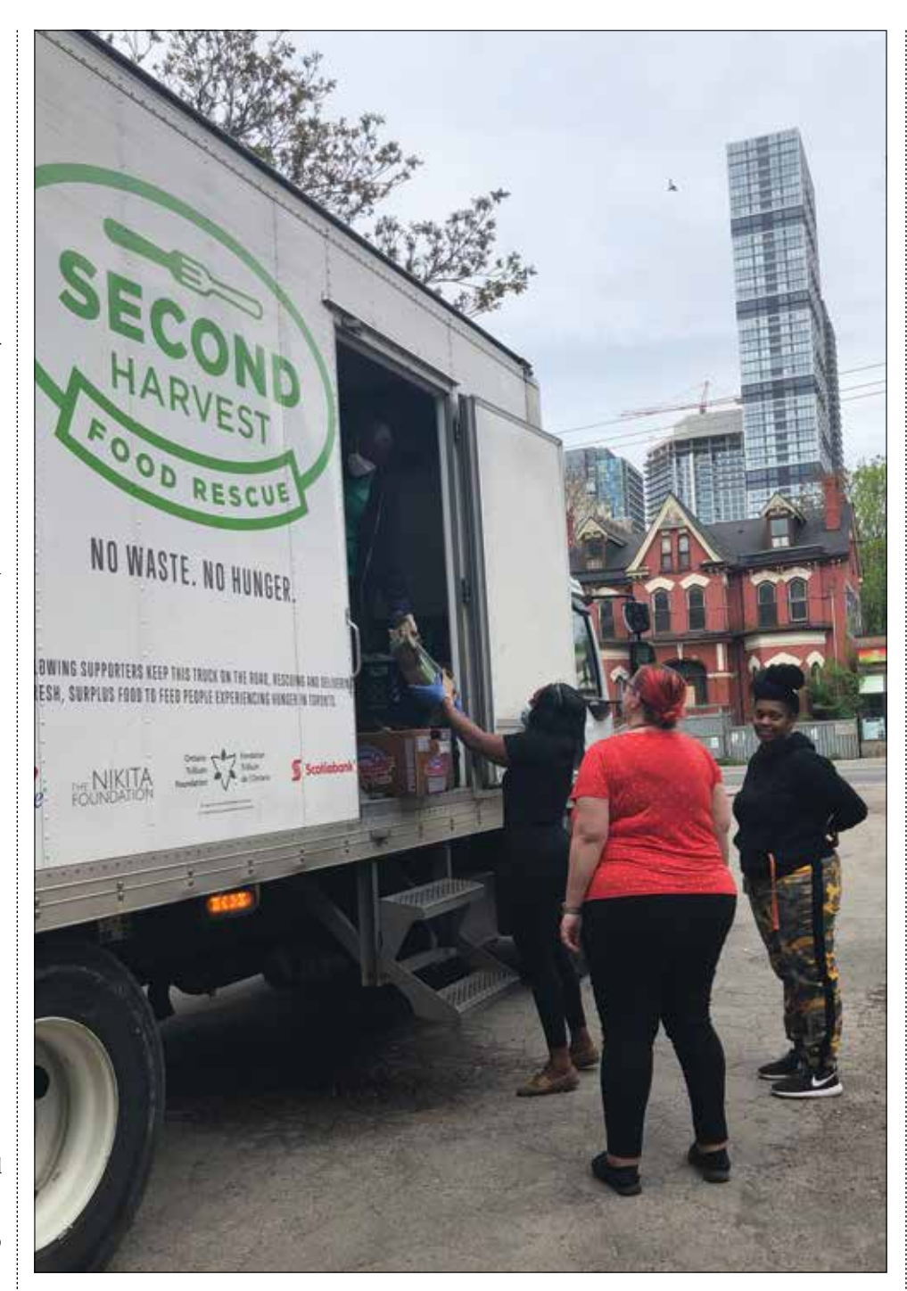
Staff unload food for clients at All Saints Church-Community Centre. At right, staff provide a meal at Church of the Redeemer.

They're so committed that in the first month of the pandemic, volunteers