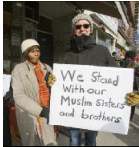
People hold up signs during a 'ring of peace' outside a Toronto mosque in February after a gunman killed six people and wounded 19 at a Quebec City mosque in late January.

I am reminded of an old joke that asks the listener if they know how to eat an elephant. Like many jokes, the answer is simple – one bite at a time, just like anything else. As individuals, there are many