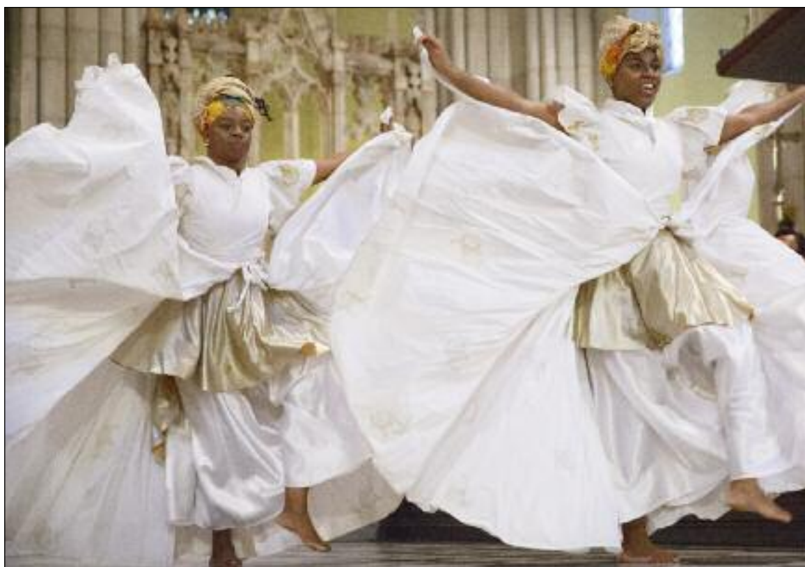
Dancers from the Caribbean Dance Theatre perform during the service.