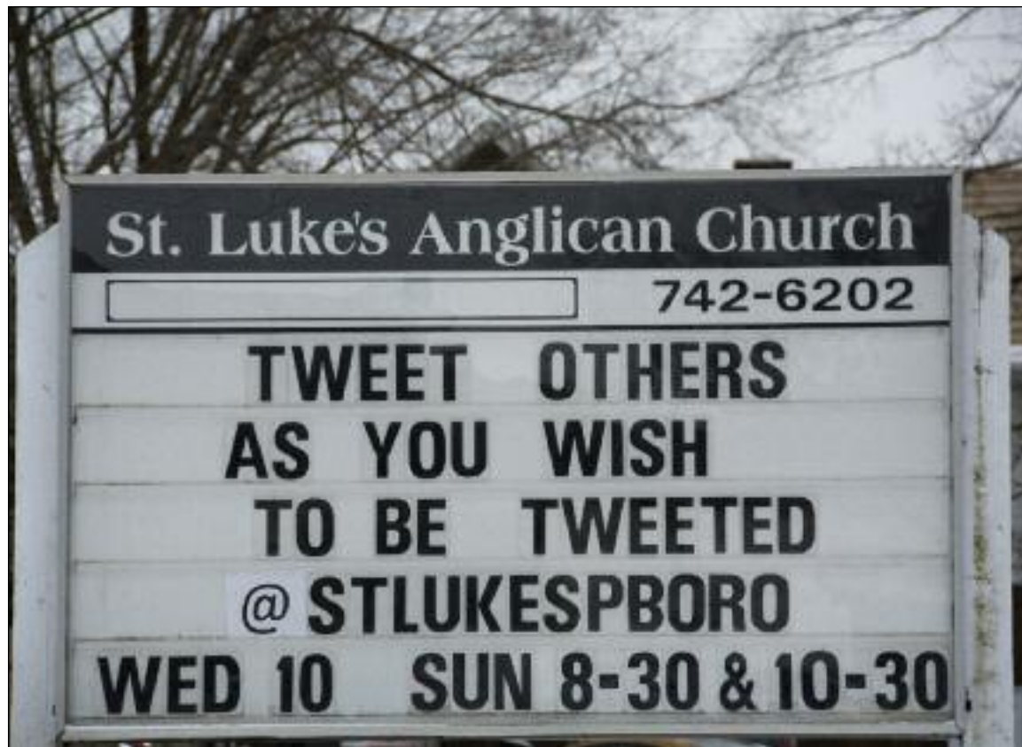
St. Luke's sign has been seen by thousands of people in Canada and the United States.

As the posting took off, Ms. Stephen sent a Twitter message to the church: "Bravo to you! Thousands of people have been amused and tickled by your