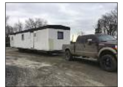
A construction trailer arrives in Oshawa, where it will be fixed up and used as a station for seafarers.