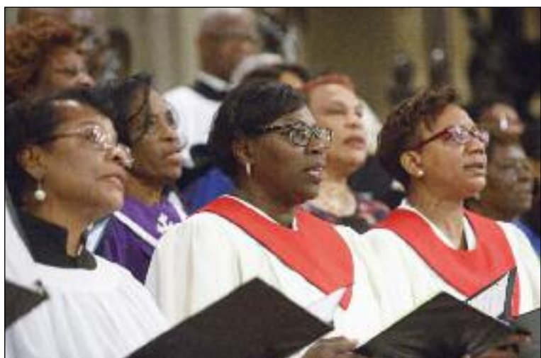
Members of the Combined Diocesan Choir sing.