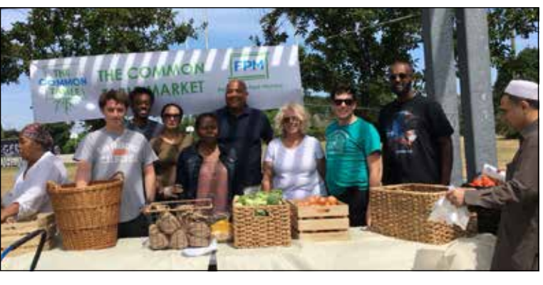
Staff and volunteers of Flemingdon Park Ministry in Toronto provide fresh food for local residents last summer.

He added: "I'm incredibly grateful for parishes and individuals who take the time not just to support