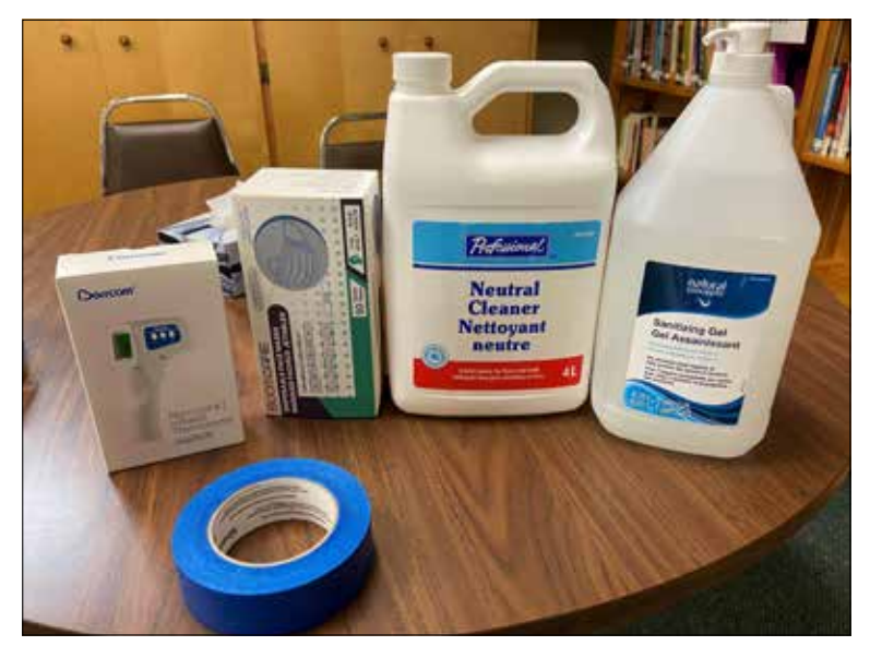
Cleaning products at St. Paul, Lindsay