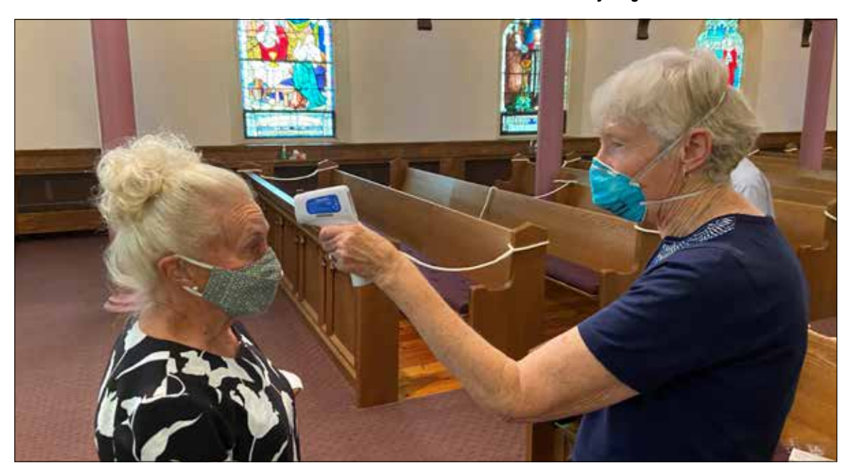
Members of St. Paul, Lindsay practice with a thermometer gun.