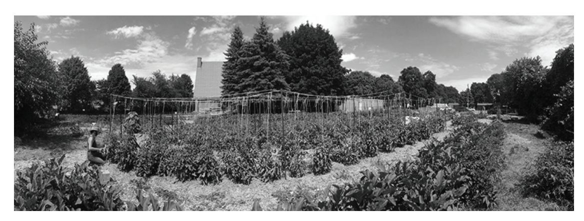
The Common Table Urban Farm at the Church of Our Saviour, Don Mills, is a project of Flemingdon Park Ministry, which works with refugees and newcomers in the community.

Many people who are new to Canada, and many who are not, do not have easy access to land for gardening or growing food. Walk around your church property or your neighbourhood or even in a local park, and discuss where you might garden. Invite your neighbours and make it a community garden! The Bishop's Committee on Creation Care has created a community garden toolkit; it can be accessed here: <a href="https://www.toronto.anglican.ca/diocesan-life/social-justice-advocacy/creation-care/practical-greening">https://www.toronto.anglican.ca/diocesan-life/social-justice-advocacy/creation-care/practical-greening</a>