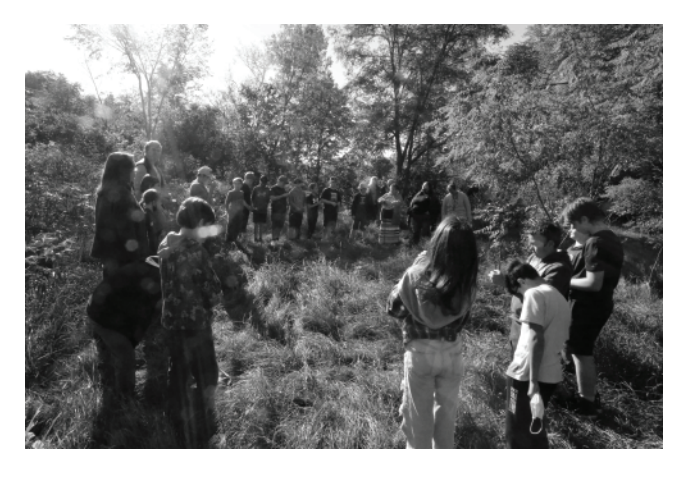
A teaching gathering at the site of the future Mishkodeh Centre for Indigenous Knowledge.

One suggestion from this video is that those who are non-Indigenous identify a project that can be worked on with Indigenous people as a way to work together, build relationships and create trust for further work around land issues and conservation issues. Do some brainstorming about a project like this that could happen in your community.