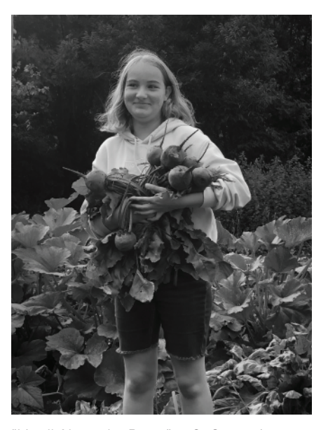
"It's all About the Beets" at St George's, Pickering Village