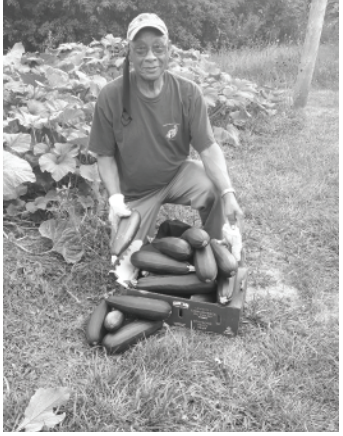
Harvesting at St George's, Pickering Village