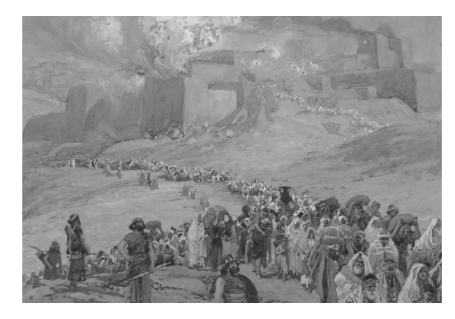
Tissot, Flight of the prisoners

This sounds simple, but it would mean paying attention to the soil of that place, learning what grows well there, when the rainy and dry seasons are and how to plant in their rhythm. It would mean learning about what animals and birds are likely to want to eat their food, and how to repel them or feed them something else, and what insects are beneficial. In short, the letter tells the people to become at home in their place, to become connected to this new place where they find themselves. When they build a relationship with creation in this new place, the community will be able to grow and flourish.