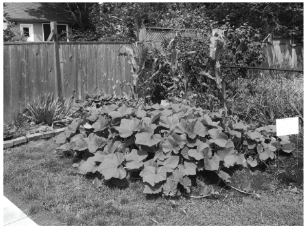
"A Vision of the Renewed Earth?" Garden Volunteers at All Saints, Whitby