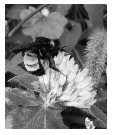
Both this American Bumble Bee and this Great Black Digger Wasp benefit from a patch of bare soil in your garden.