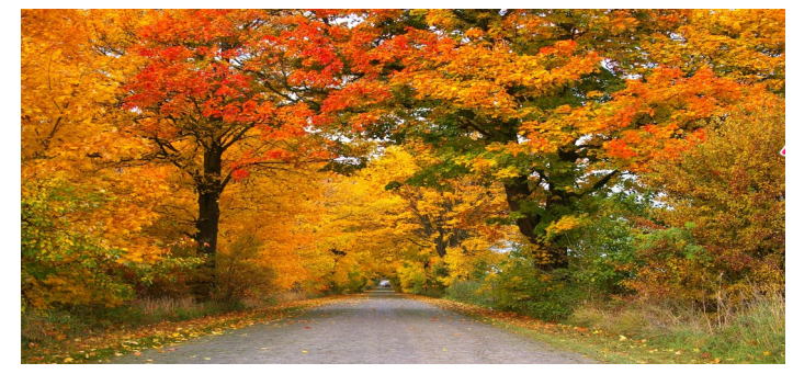
ACW Newsletter-Fall 2022