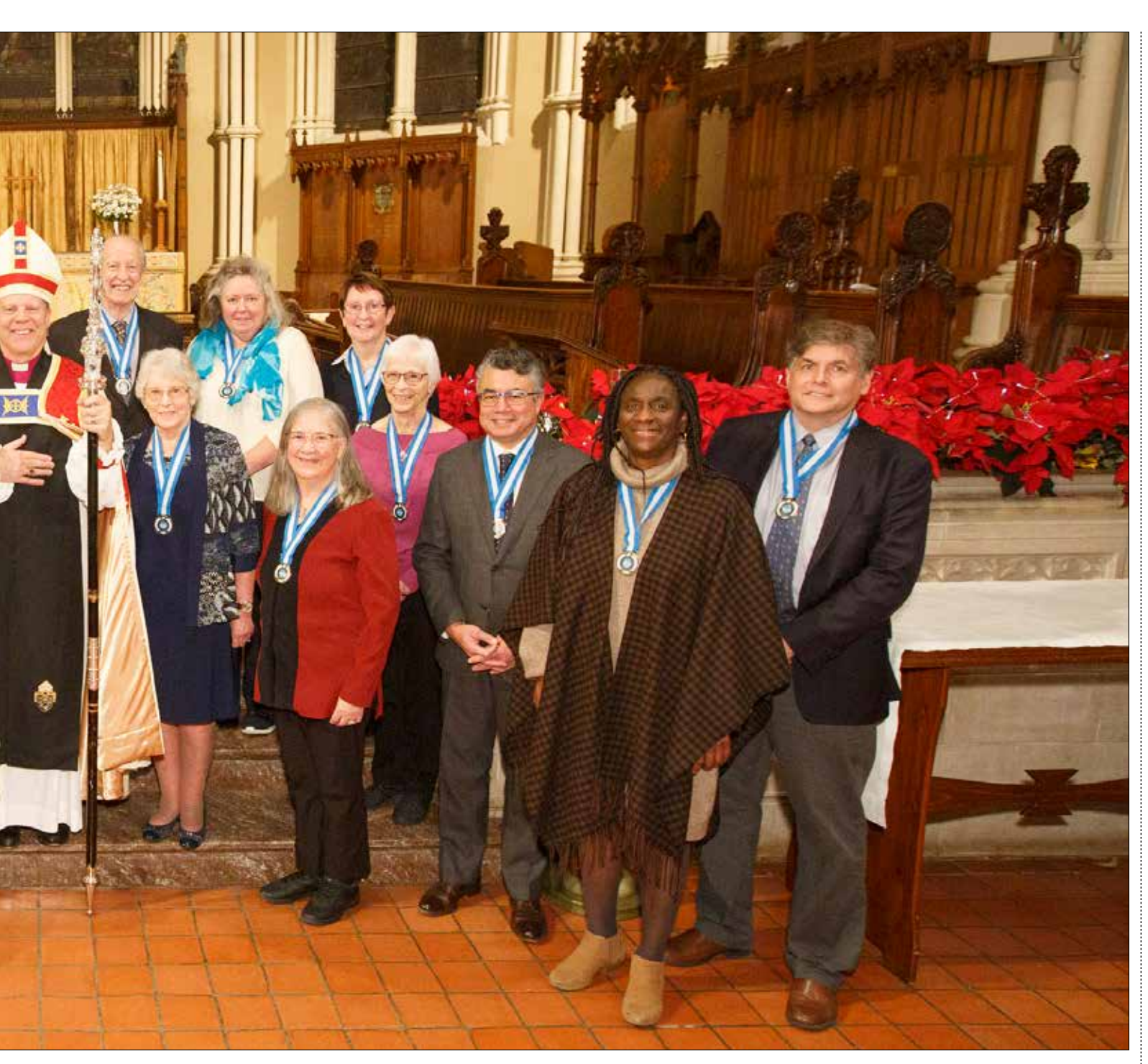
Page 8.