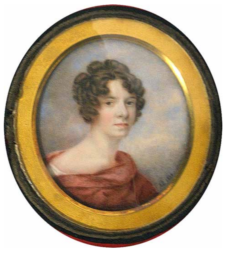
Clockwise from above: a painting of Anne Langton; the chalice and paten used in the original log cabin church in Fenelon Falls; the church's original Sunday School cabinet made from butternut trees of the Langton farm.

The exhibit also contains a soaring view of Fenelon Falls obtained by a drone camera, a ghostly walk up the stone stairs to a graveyard at the site of the original church and