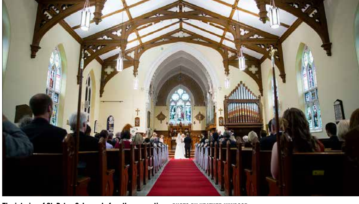
The interior of St. Peter, Cobourg before the renovations.

• Spend as much time as needed in discernment, even if some think it's wasted time – it is