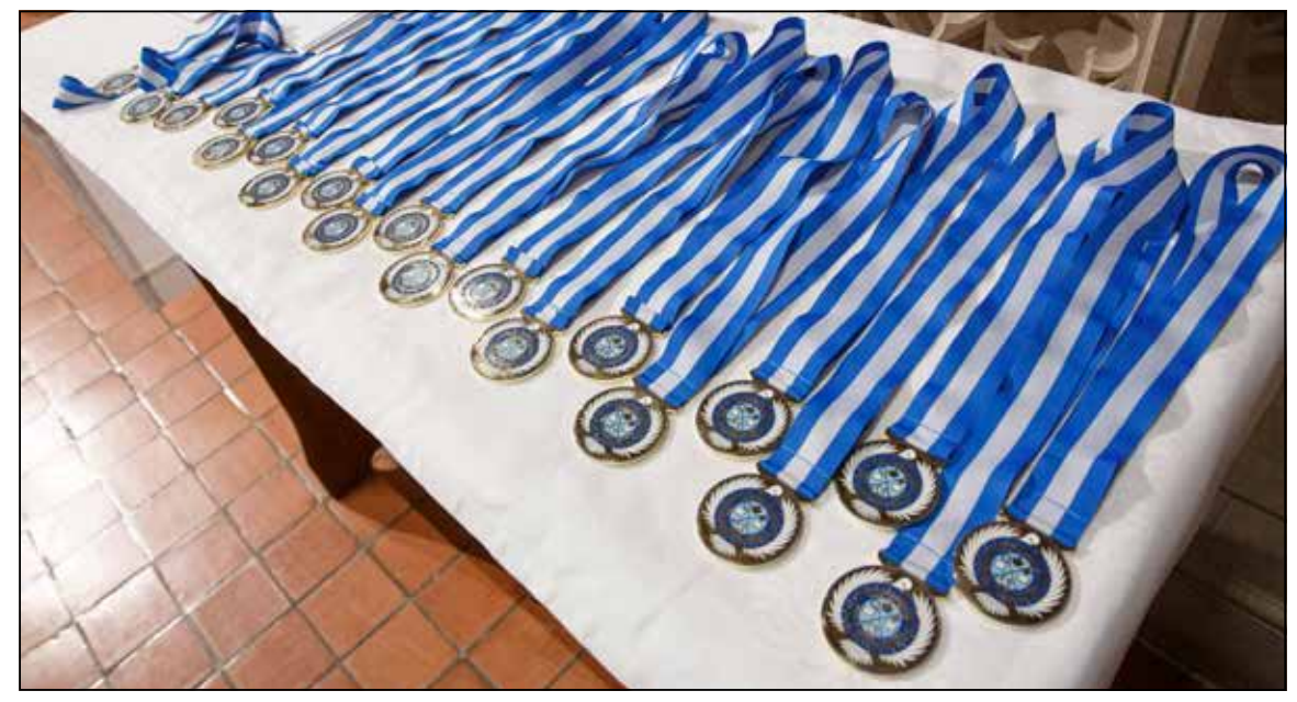
The Order of the Diocese of Toronto medallions.