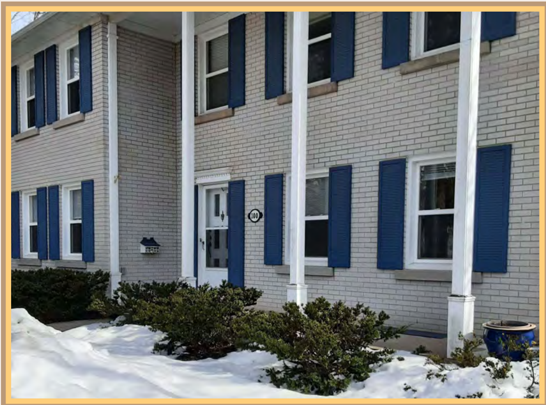
Our Large Rectory

Lord, God Almighty, as we send out our members in search of a new priest for this our family here at St. Mary's we seek Thy guidance in finding and selecting that priest that will fulfil Thy purpose for us at this time of uncertainty in The Church and the world. Anoint the members of our Selection Committee and grant them Grace to yield to the guidance of Thy Holy Spirit in all their deliberations, this we ask in the peerless name of Thy son Jesus Christ Our Saviour. Amen