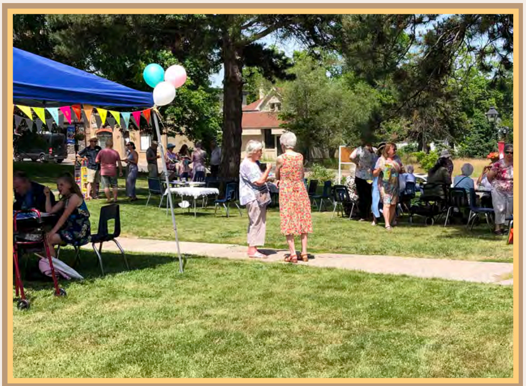
We are Family

"I came because I was looking for an Anglican Church nearby as I had just moved to Richmond Hill."