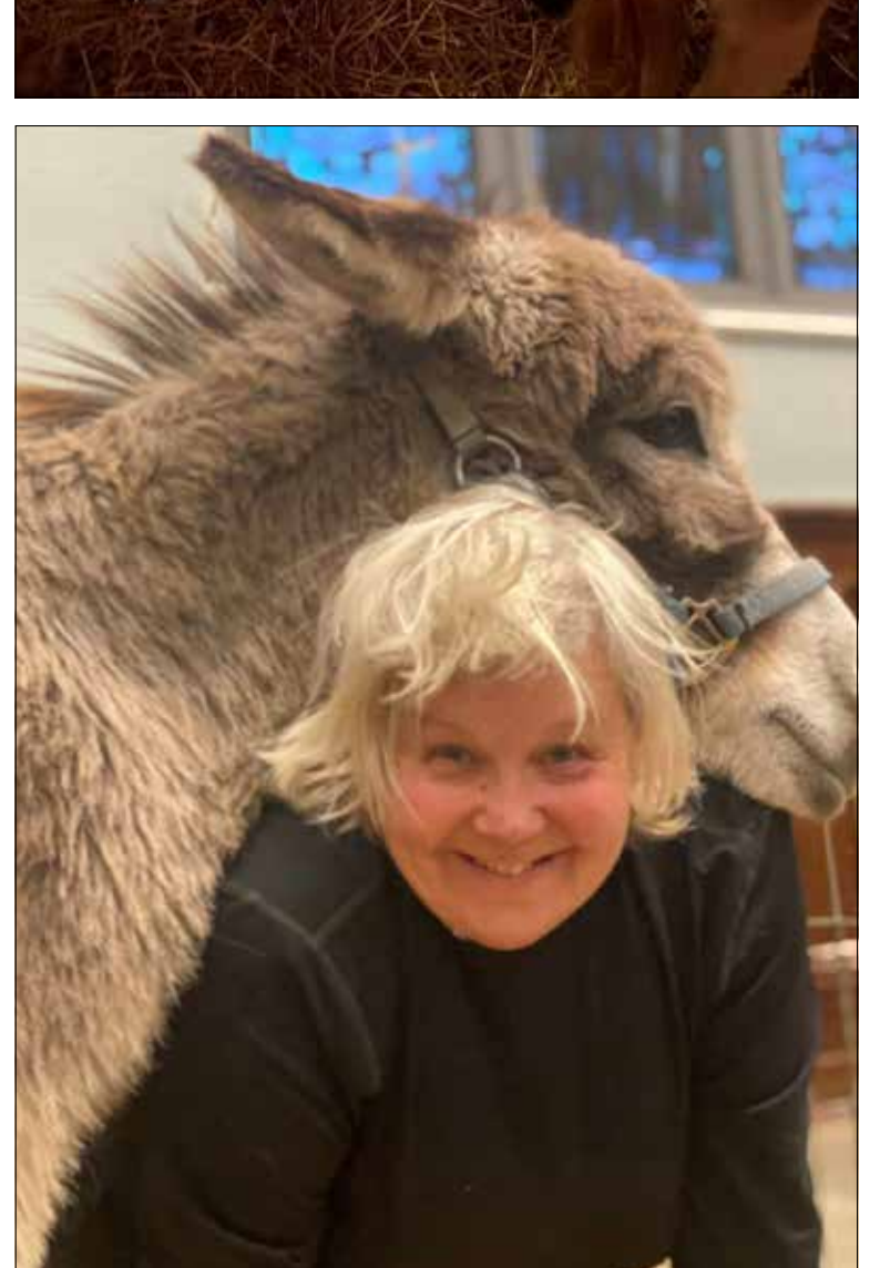
A cow, an alpaca, sheep, a goat and a donkey make themselves at home inside St. Peter, Cobourg during a Christmas Eve service.