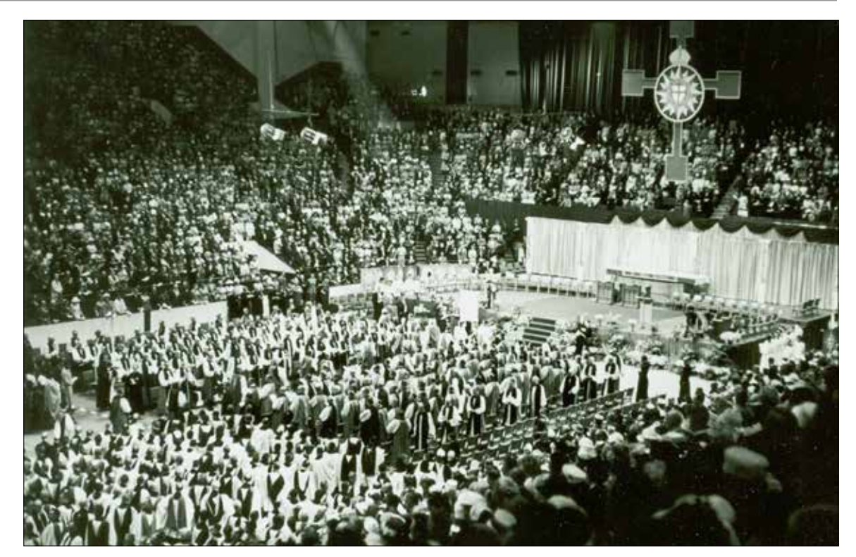
Anglicans pack Maple Leaf Gardens for the opening service of the 1963 Toronto Anglican Congress.

To mark the 60th anniversary of that historic gathering, a conference will be held April 12-13 at St. Paul, Bloor Street. The conference will explore the lead-up to the Anglican Congress, the gathering itself, the personalities involved, its manifesto and its impact on the Anglican Communion. It might also help pave the way for another