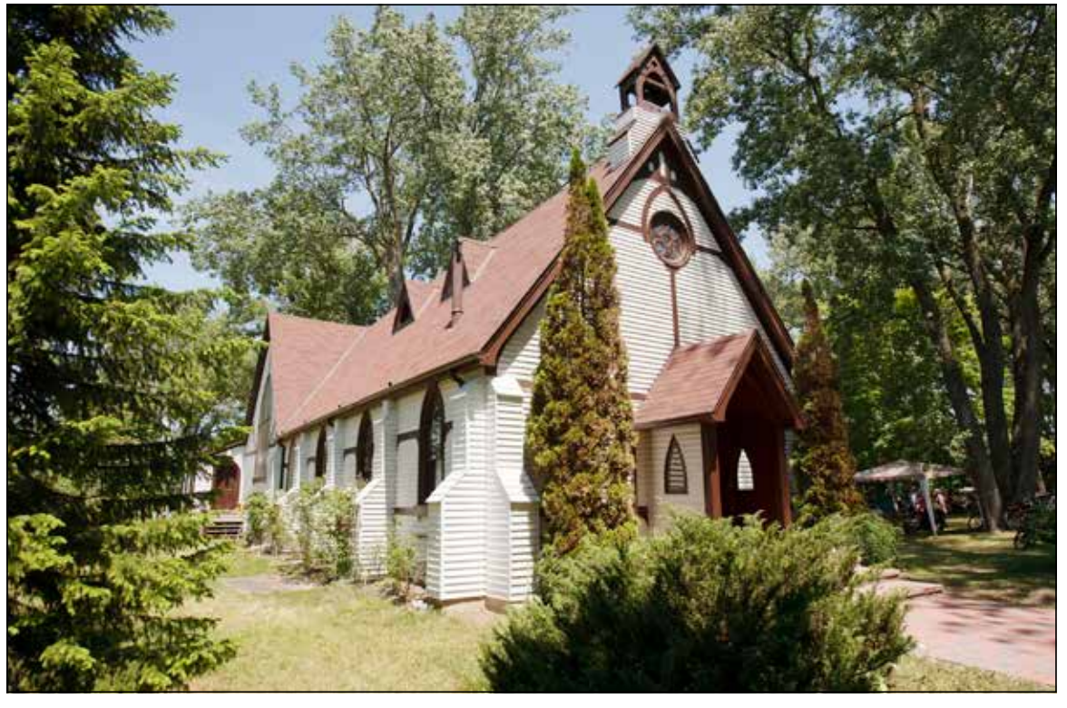
St. Andrew by-the-Lake, located on Toronto Islands, is just a ferry ride away from the city and steps away from the lake.

But she soon realized that what made St. Andrew by-the-Lake so unique also meant that growth would need to look somewhat