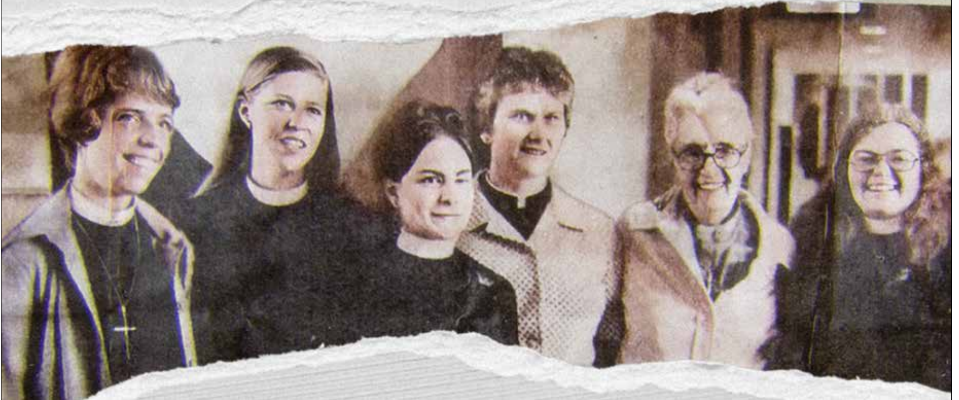
Some of the first female priests in The Episcopal Church are shown in this image from the documentary.