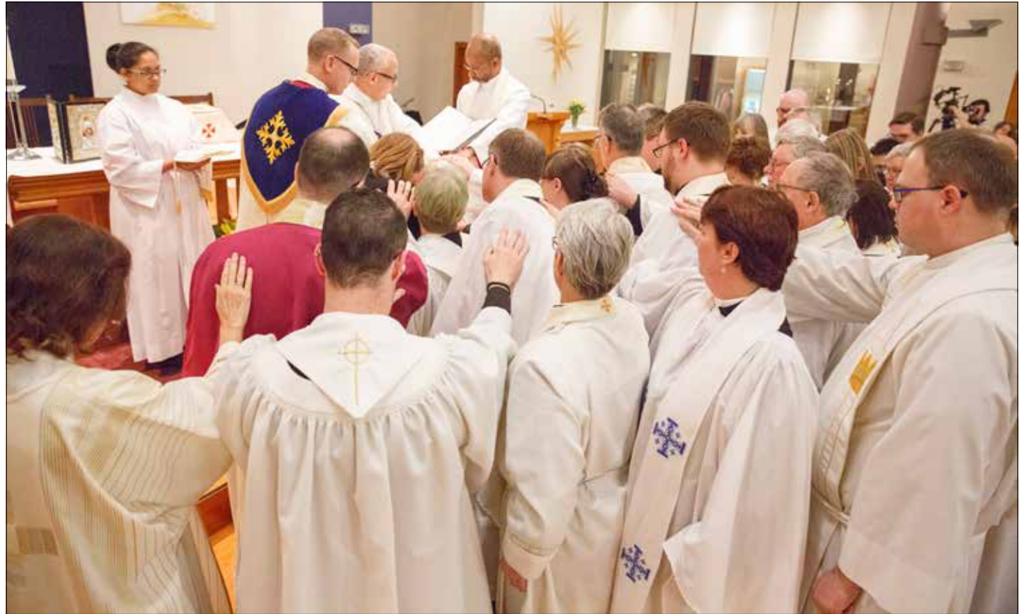
A priest is ordained in the Diocese of Toronto. The diocese is dedicating April 21 as Vocations Sunday, an intentional day of prayer for priestly vocations.

In anticipation of this, each diocese in the Province did a focused consultation: a meeting of priests from what we are calling “incubator parishes” – those places that are particularly good at identifying, encouraging and nurturing new vocations, or where the clergy themselves model the priesthood in a way that raises up aspirants. I was pleased to host such a conversation last fall, inviting priests from such disparate parishes as Church of the Redeemer, Bloor St. and St. Paul,