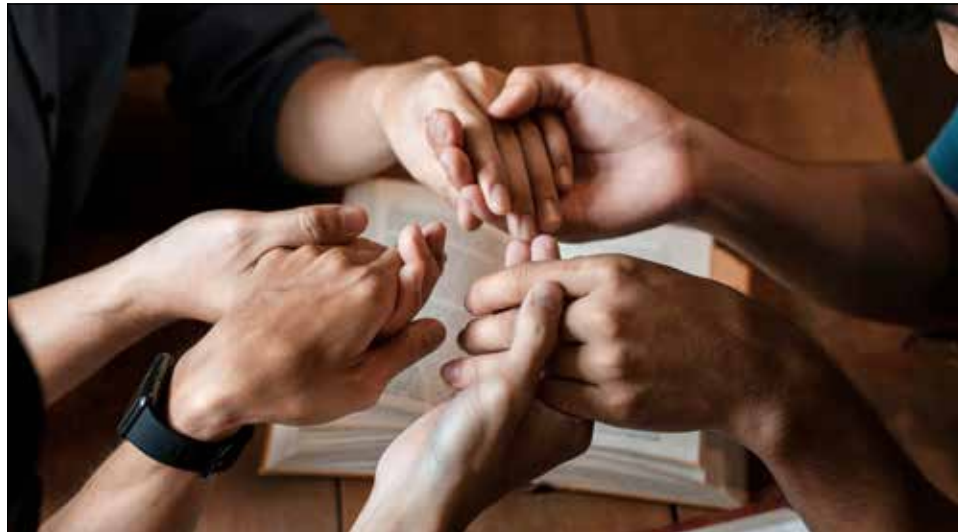
Disciplines associated with renewal include widespread prayer, a deeper engagement with Holy Scripture, a commitment to worship, and the practice of sharing the faith through word and deed.

Although we humans can't make spiritual renewal happen, here is why I'm hopeful for such renewal in our own time: God has told us in the scriptures that he wants to breathe new life into his people, for the sake of the world he loves. Stretching