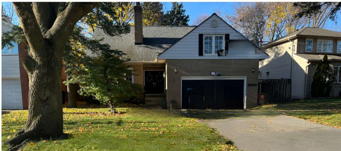
The four-bedroom rectory, located near the church, is available, further strengthening the connection between the church and its clergy

St George's has a large parking lot which is shared with Kingsway College School which is located next to St. George's. It is served by TTC bus routes, bus 40A, or Royal York bus 73B/73C. A street reconfiguration completed in 2024 has added bike lanes and a new signalled intersection that allow people to cross Dundas Street safely at the church. This has significantly improved bike and pedestrian accessibility.