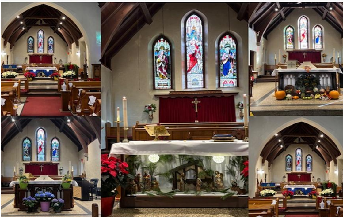
St. Andrew altar decorated for seasons throughout the year.